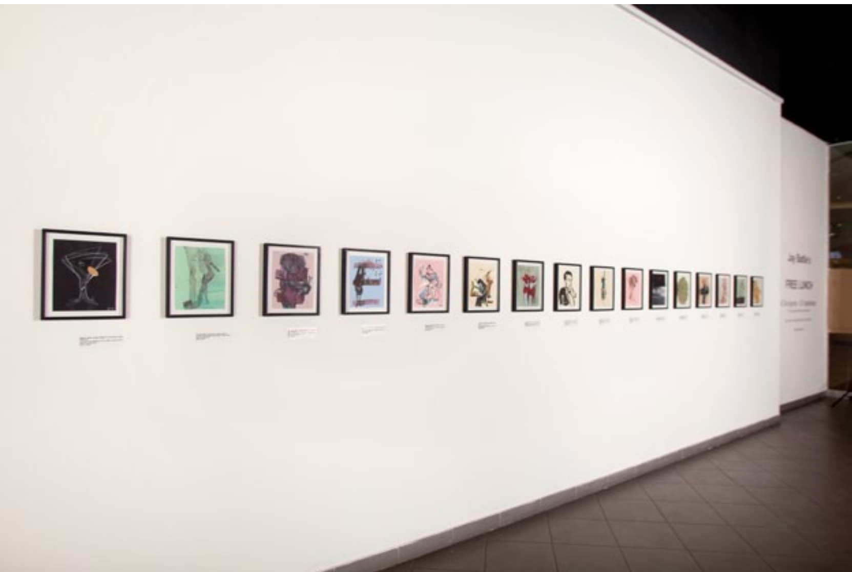
Free Lunch Installation