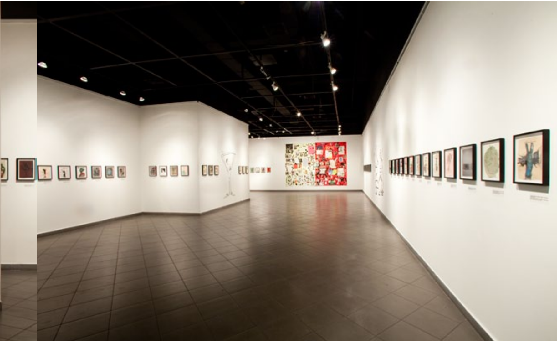
Free Lunch Installation