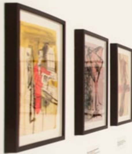
Figura de Mulier (Pink Head) The Stationary Series 1939-40 Cromatada sobre aluminiciu. Inchi, galben si portocaliu 20cm x 20cm