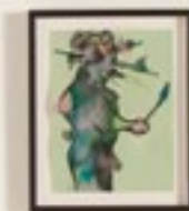
Figura de Mulier (Pink Head) The Stationary Series 1939-40 Cromatada sobre aluminiciu. Inchi, galben si portocaliu 20cm x 20cm