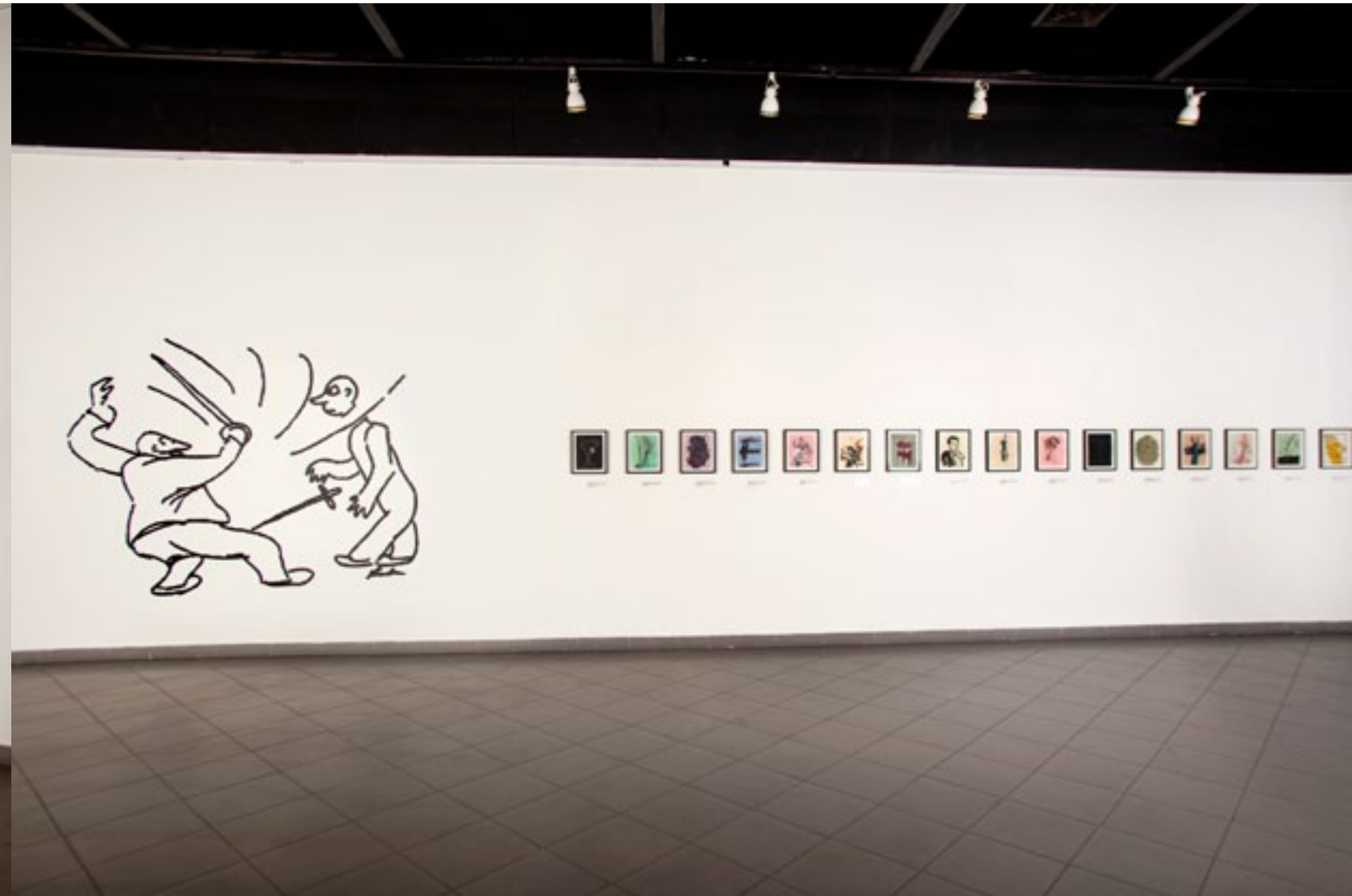
Free Lunch Installation