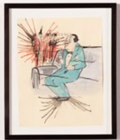
Figura de Mulier (Pink Head) The Stationary Series 1939-40 Cromatada sobre aluminiciu. Inchi, galben si portocaliu 20cm x 20cm