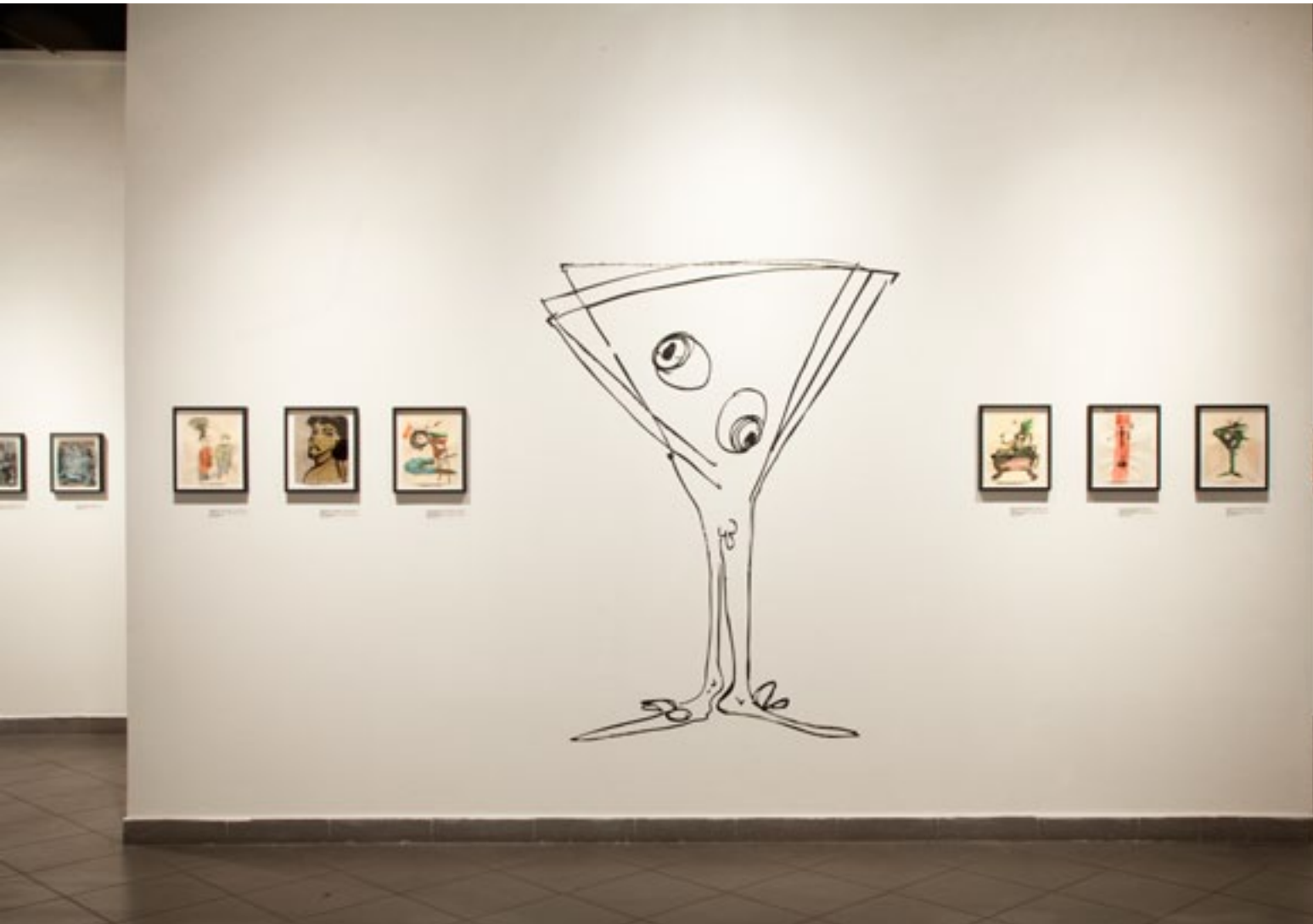
Free Lunch Installation