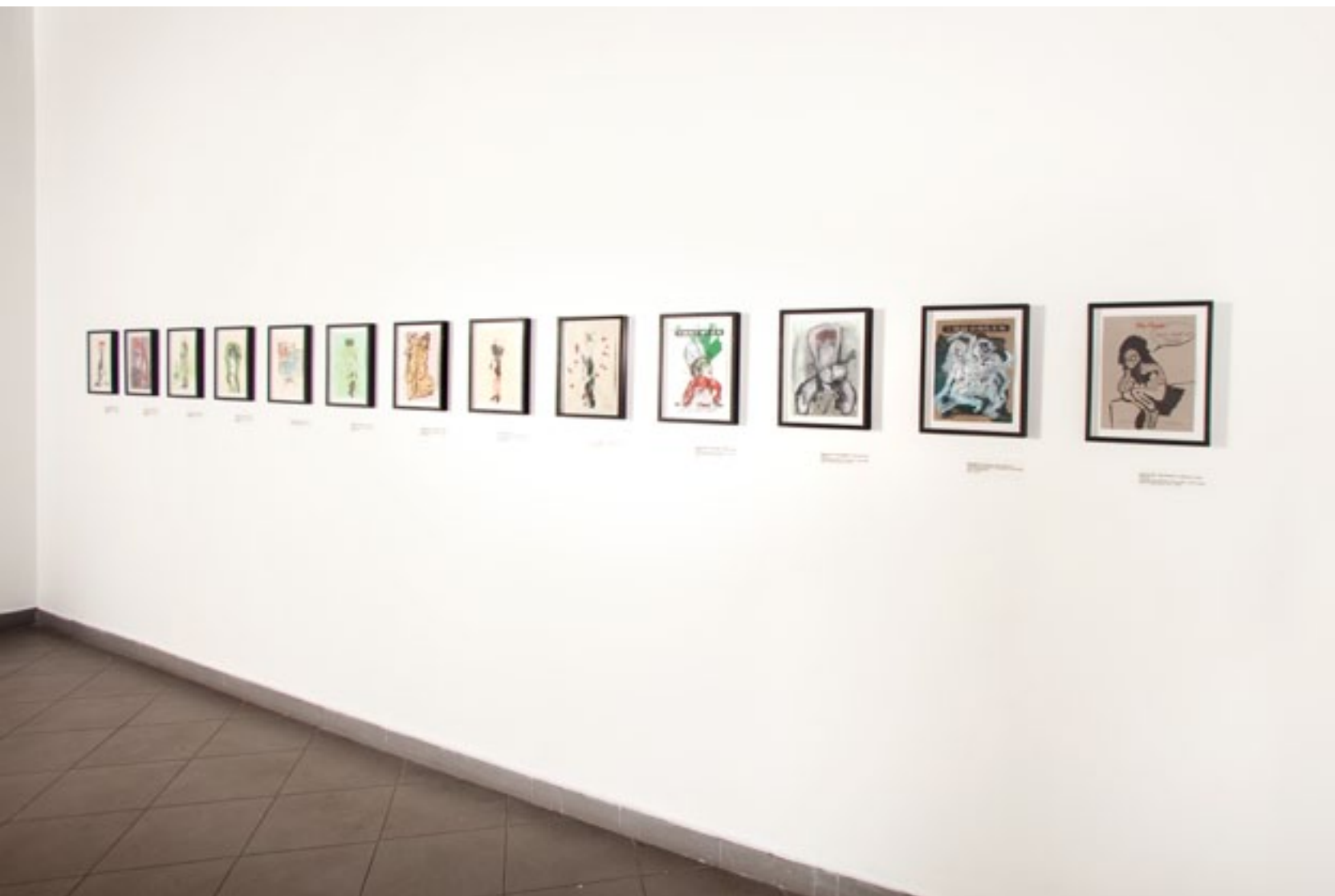
Free Lunch Installation