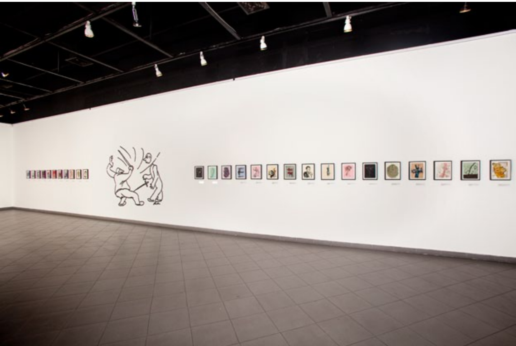
Free Lunch Installation