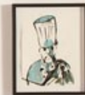
Figura de Mulier (Pink Head) The Stationary Series 1939-40 Cromatada sobre aluminiciu. Inchi, galben si portocaliu 20cm x 20cm