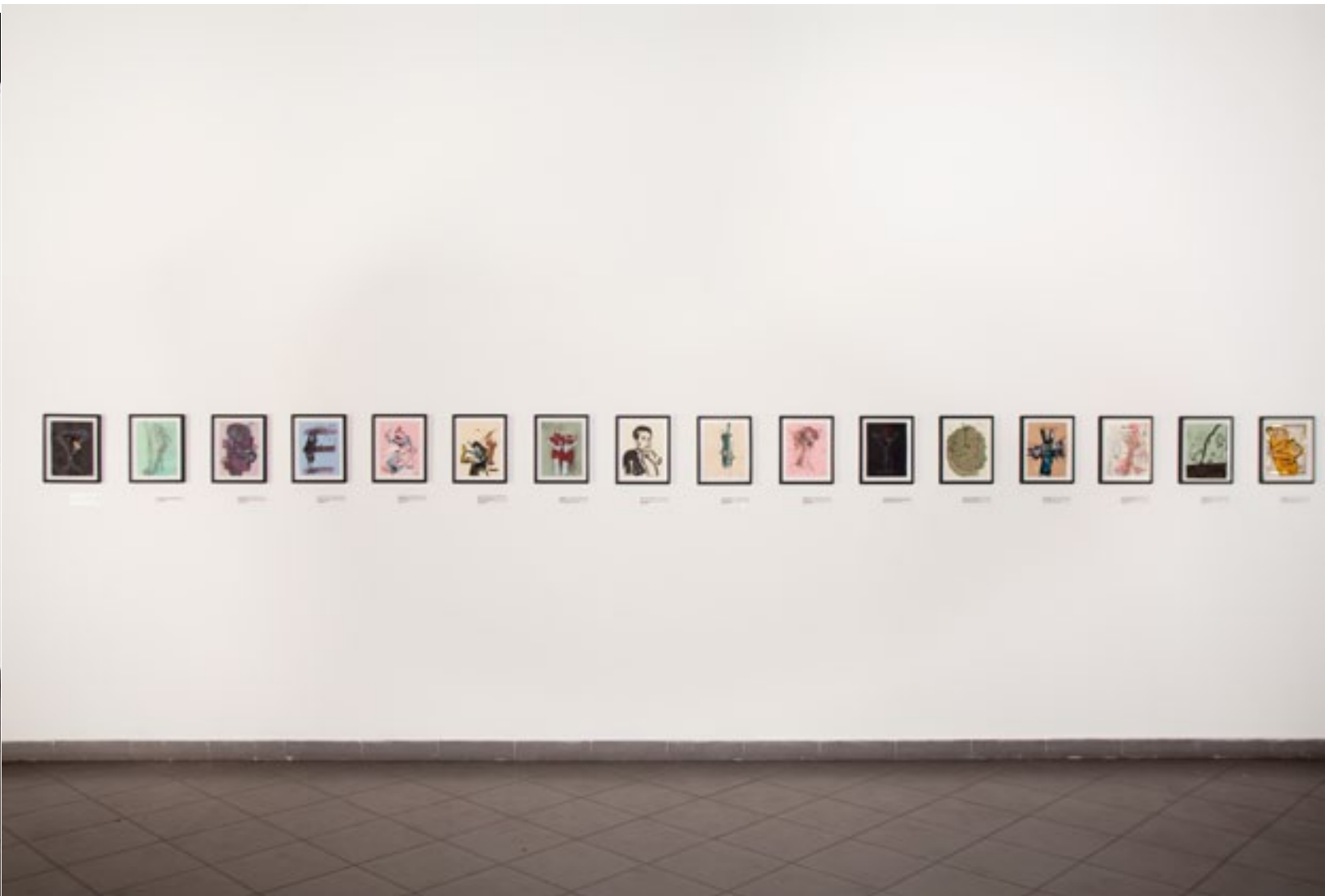
Free Lunch Installation