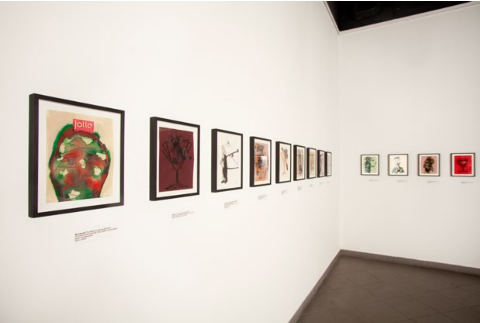
Free Lunch Installation