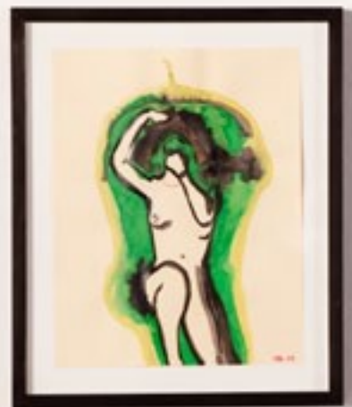
Figura de Mulier (Pink Head) The Stationary Series 1939-40 Cromatada sobre aluminiciu. Inchi, galben si portocaliu 20cm x 20cm