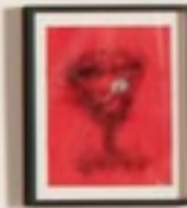
Figura de Mulier (Pink Head) The Stationary Series 1939-40 Cromatada sobre aluminiciu. Inchi, galben si portocaliu 20cm x 20cm