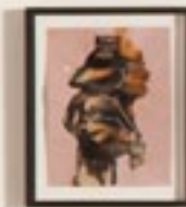
Figura de Mulier (Pink Head) The Stationary Series 1939-40 Cromatada sobre aluminiciu. Inchi, galben si portocaliu 20cm x 20cm