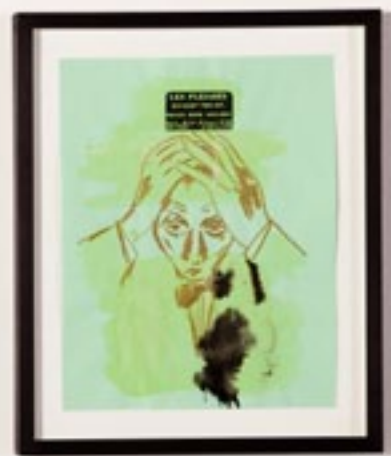
Figura de Mulier (Pink Head) The Stationary Series 1939-40 Cromatada sobre aluminiciu. Inchi, galben si portocaliu 20cm x 20cm