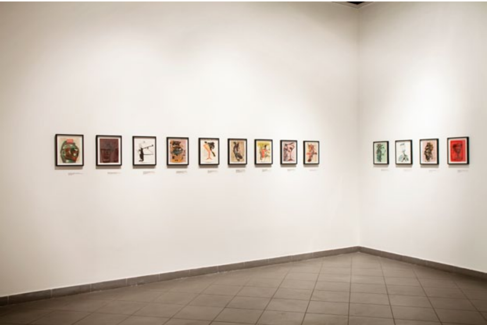
Free Lunch Installation