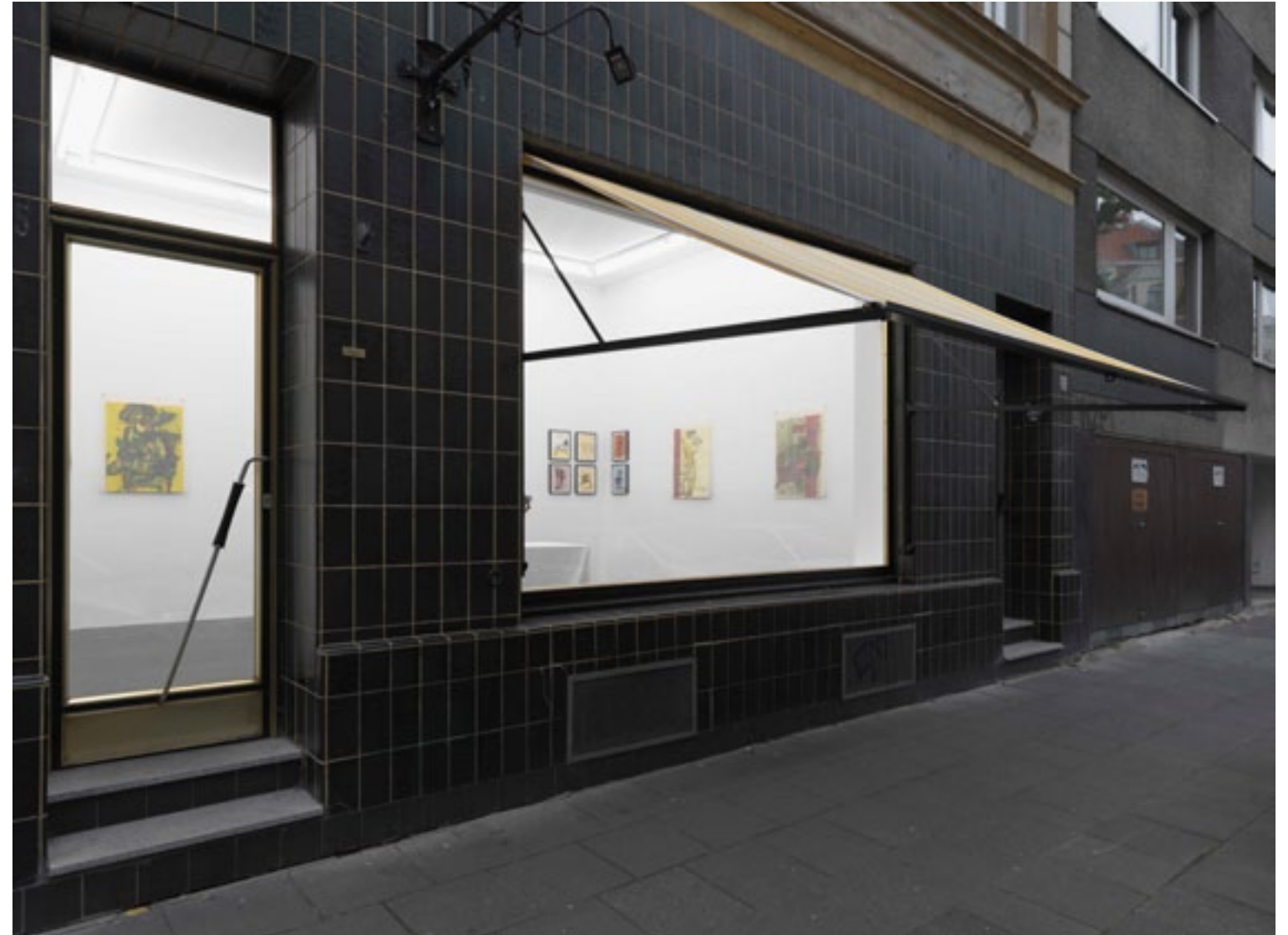
Sauce Américaine Installation