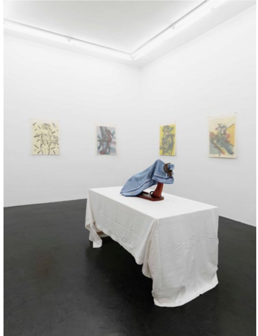
Sauce Américaine Installation