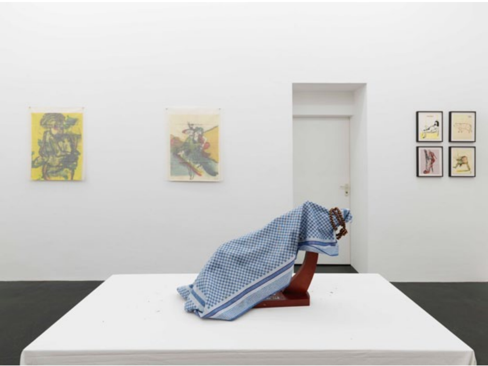
Sauce Américaine Installation