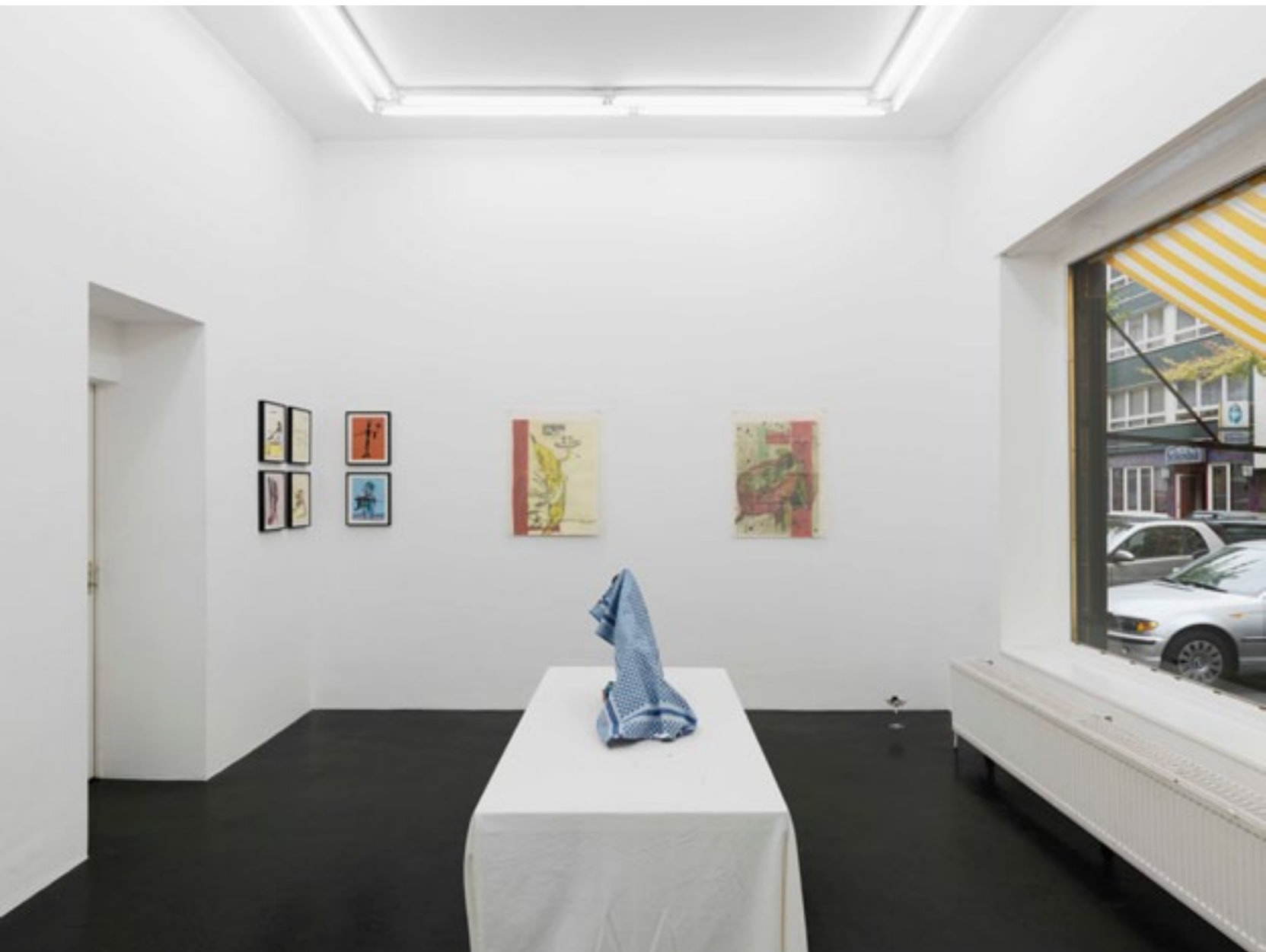
Sauce Américaine Installation