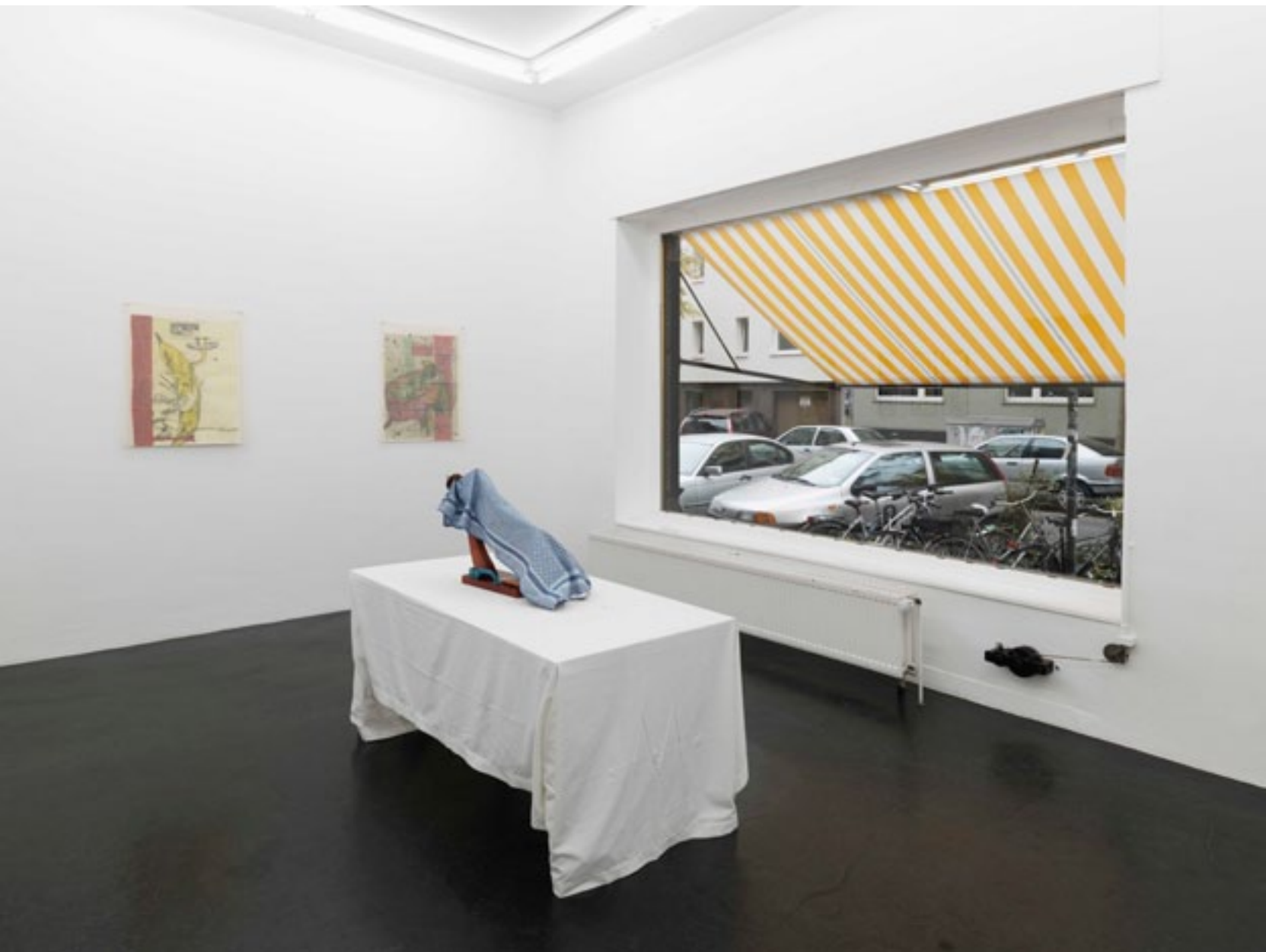
Sauce Américaine Installation