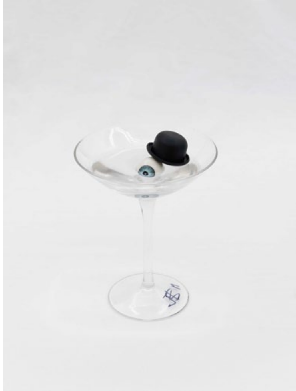
"Four Martini Lunch"