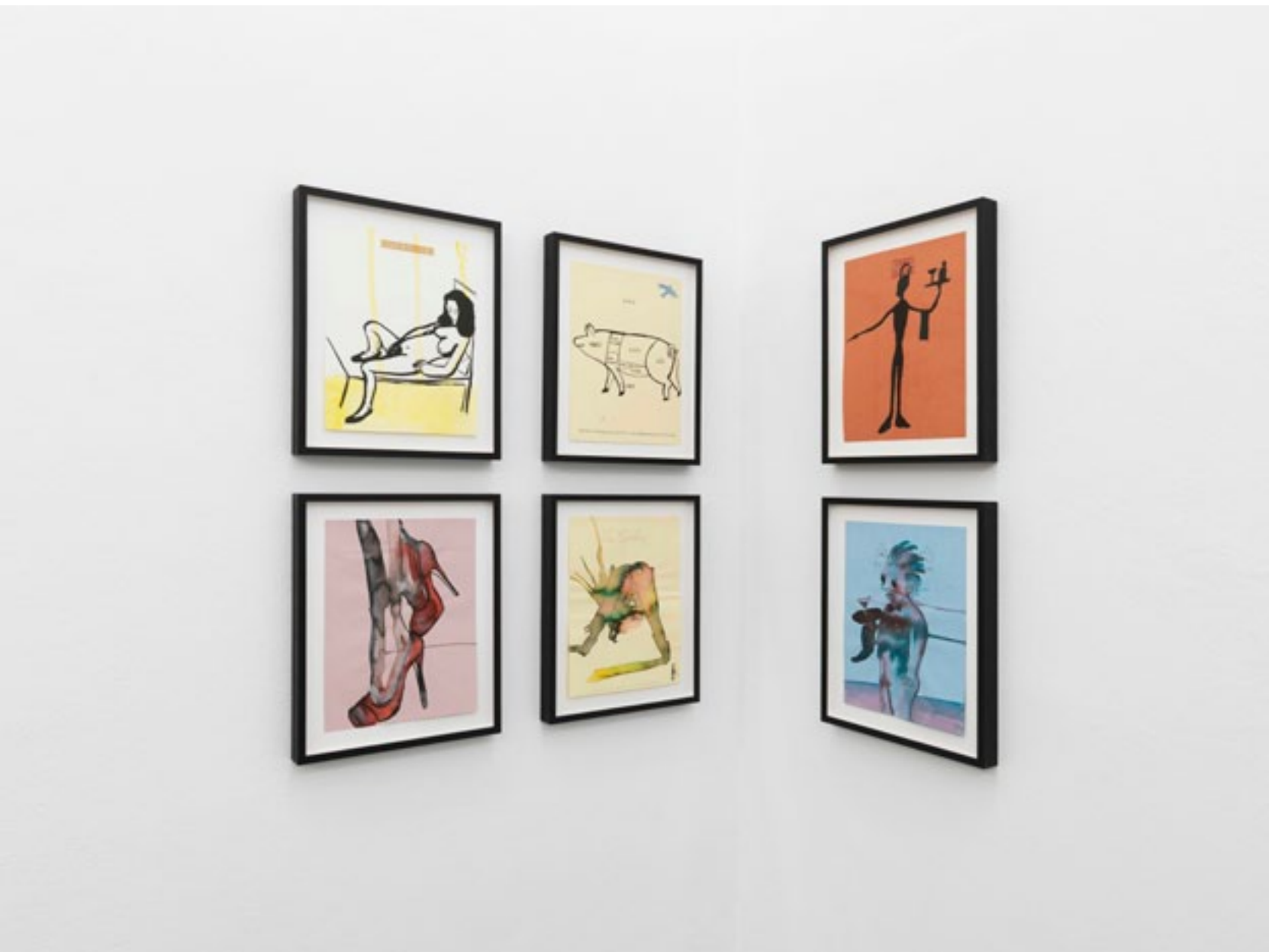
Sauce Américaine Installation